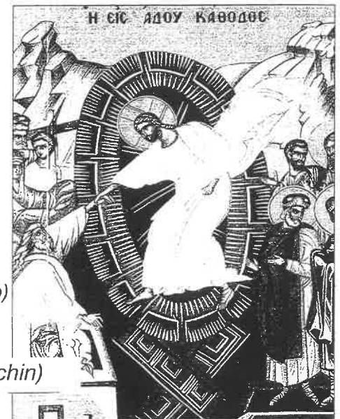
Icon of the Descent into Hades

RESURRECTION OF OUR LORD GOD AND SAVIOR JESUS CHRIST